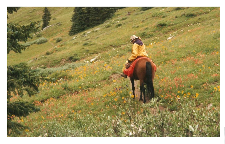
Between Searle Pass & Camp Hale